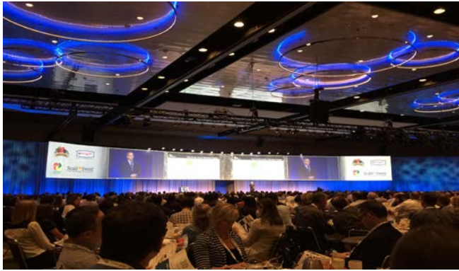
General Session at the Produce Marketing Fresh Summit Conference.

On October 14-16, 2016, the California Blueberry Commission attended the Produce Marketing Association's (PMA) international convention and exposition in Orlando, FL. The convention allowed the Commission the ideal opportunity to meet with and maintain relationships with other industry leaders while being updated on several current industry topics and workshops. The Commission also participated in a breakfast that was hosted by the US Apple Export Council (USAEC). This breakfast was designed to bring all major importers from Mexico, Central America, Asia, India, and other important trading partners into one room and educate them about the USAEC and its membership. This particular breakfast had around 150 guests with most of them demonstrating large interest in importing apples from California. If you have any questions or would like more information about certain countries that participated, contact the Commission office.